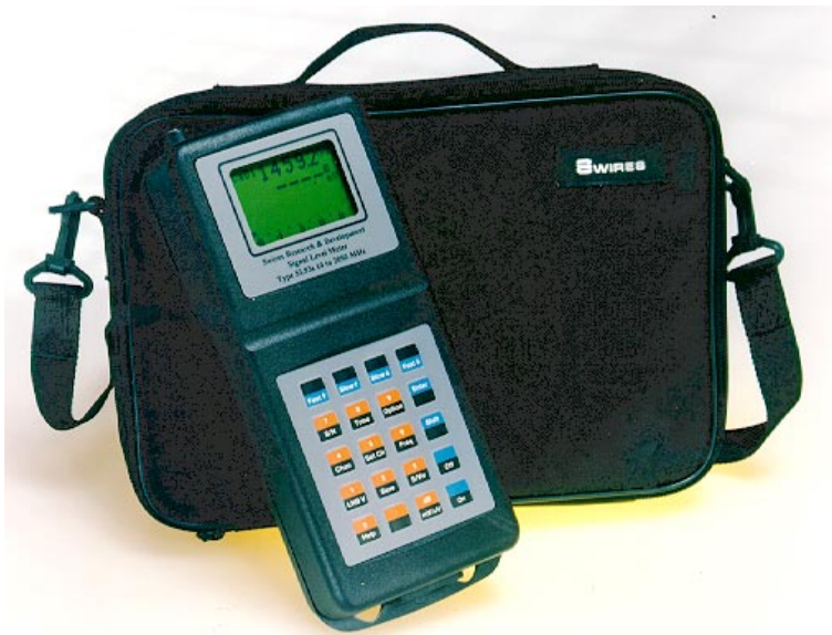
SL93 and deluxe carrying case

Swires Research 40 Hornsby Square Southfields Industrial Park Laindon Basildon Essex. SS15 6SD England